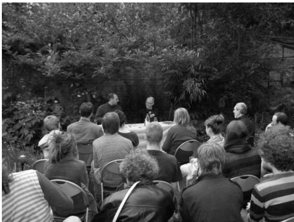
Cocktails under the magnolia at the Manchester launch of 'Moments of Excess'

Last July, SHIFT Magazine invited the authors of the new book 'Moments of Excess' to give a talk to the inhabitants and visitors of a Manchester housing project. For about an hour, they talked about sorcery, Harry Potter and 'fairy dust'.